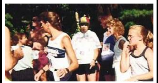
First water stop before the race.