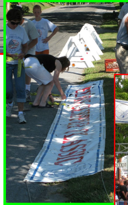
Volunteers attend to banner details.