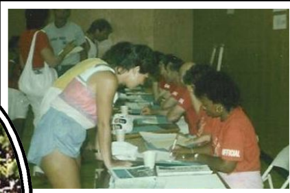
The runners register at Bellport Middle School.