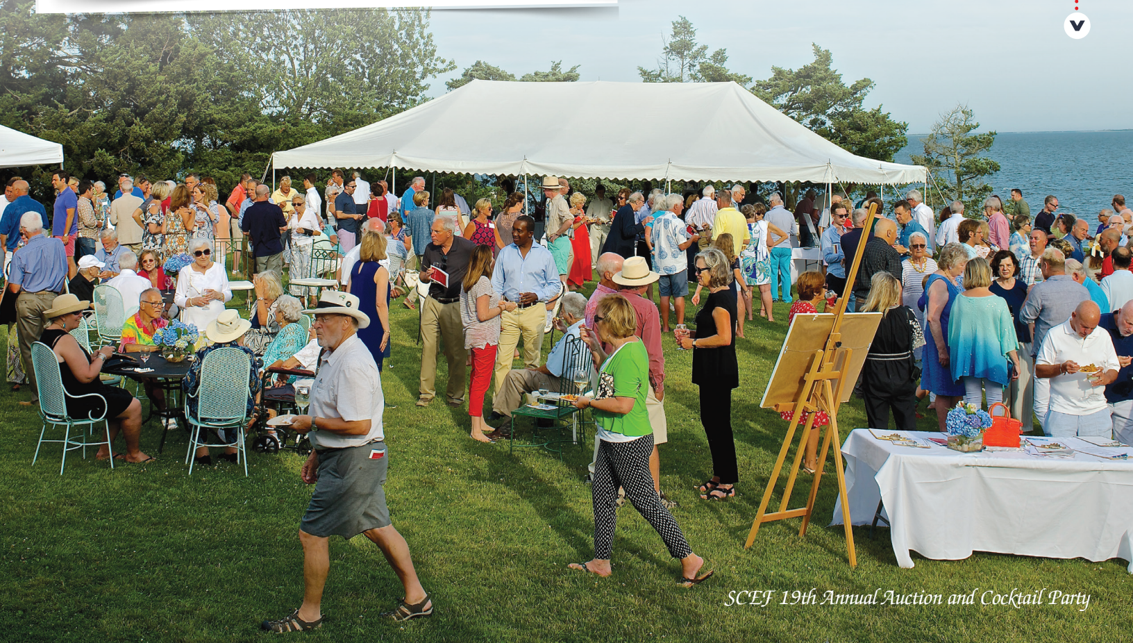
SCEF 19th Annual Auction and Cocktail Party