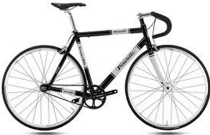
Kreb Cycle offers this Pinarello Lungavita Single Speed Messenger Bike Fixed or Free Wheel, 56cm high for a 5'8" to 6' tall person.