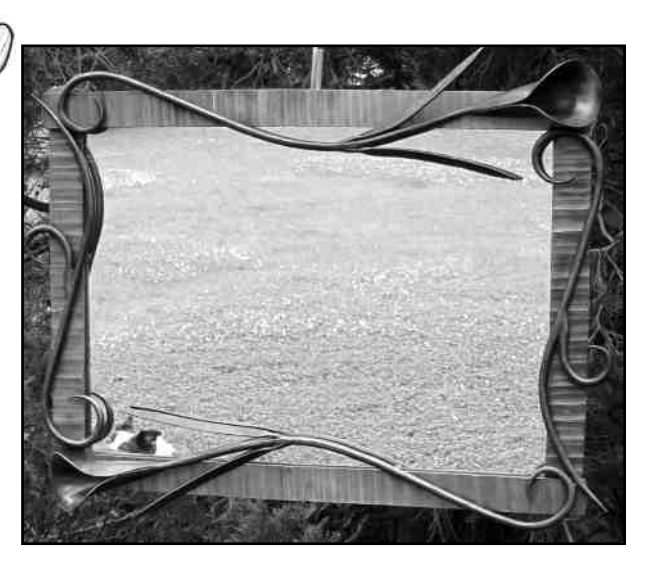
Hand-forged iron mirror from Sayville's Spirit Ironworks,

Arthur Pinajian No.1539. Bellport shore, 1973, Watercolor and pencil on paper, 15 x 21 inches. Courtesy of www.PinajianArt.com.