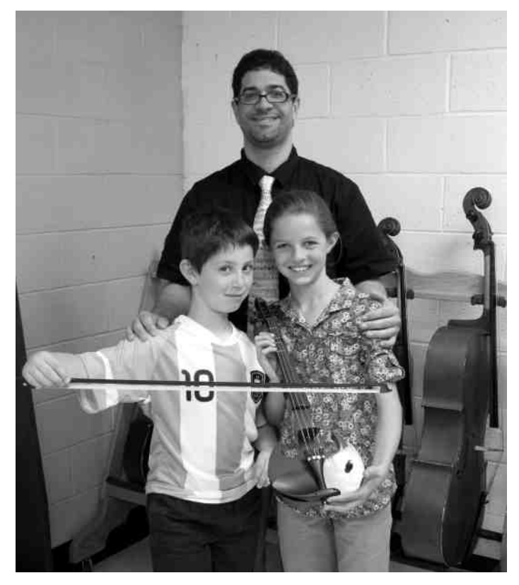
VOLUME X1, NUMBER 2 Spring 2011