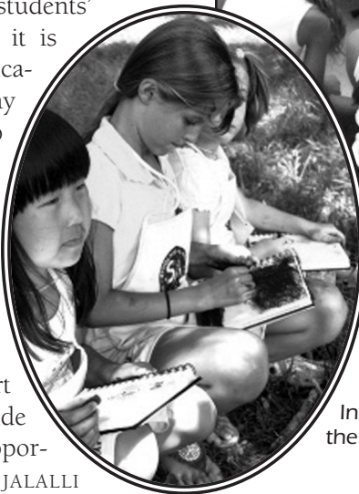
Inspired, at left, students see the world through the eyes of an artist and draw with charcoal.