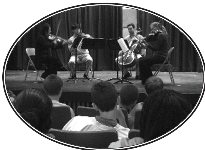
The quartet illustrated their lesson on phrasing by playing for the BMS orchestra students.

All areas to be reached by this residency are underserved in the fine arts, particularly in chamber music. The Daedalus Quartet is especially concerned about this because three of its members grew up in East Patchogue and progressed through the South Country School District's public schools. They played together for the first time in Bellport High School's Baroque Ensemble. The South Country School District's constituents range from the very wealthy to the very poor; the train tracks of the Long Island Railroad forming a line of demarcation. The challenge in such an area is to find a force that unites rather than divides, and the Daedalus Quartet firmly believes that chamber music can be that unifying force. Its members continue to be excited about bringing chamber music, and its attending spirit of cooperation, to the community that nurtured them.