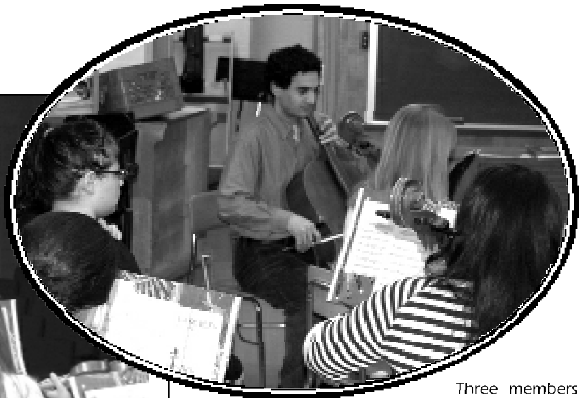
Three members of the Daedalus Quartet who gave master classes at the high school this year.

Daedalus Quartet is especially concerned about this because three of its members grew up in East Patchogue and progressed through the South Country School District's public schools; they played together for the first time in Bellport High School's Baroque Ensemble. The South Country School District's constituents range from the very wealthy to the very poor; the train tracks of the Long Island Railroad forming a line of demarcation. The challenge in such an area is to find a force that unites rather than divides, and the Daedalus Quartet firmly believes that chamber music can be that unifying force. Its members are excited about the prospect of bringing chamber music, and its attending spirit of cooperation, to the community that nurtured them.