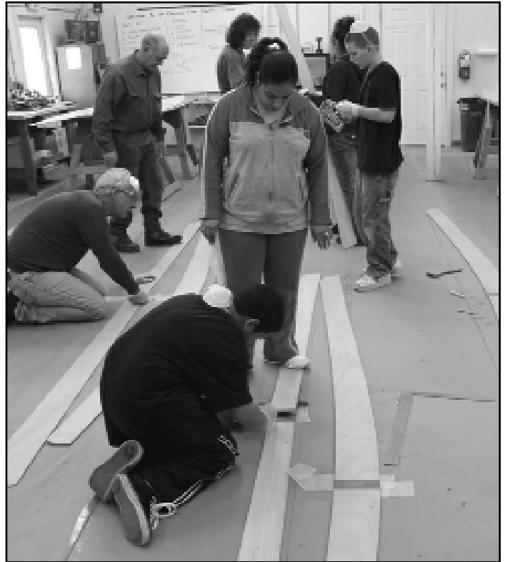
Putting together parts for the kayaks.